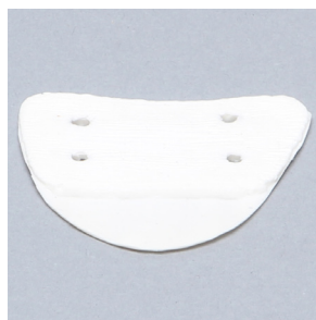
1415-8-2 Transverse wrist ligament